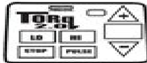
035236 Control Panel Overlay