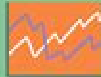
Recent Price Patterns