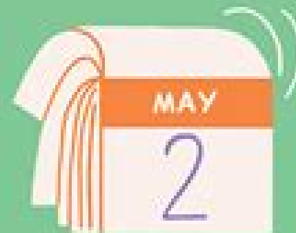
Buy and hold