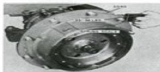
Fig. 025 — Use method shown to check wheel hub bearing preload.

27. SPINDLE SUPPORT. The spindle support can be serviced after planet spider and wheel hub assemblies are removed as outlined in paragraphs 23 and 25. However, if service