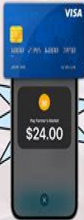
Tap to Pay