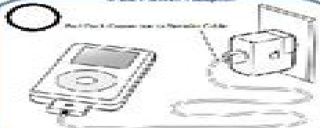
Use iPod Connector to FireWire Cable