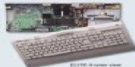
Elite-II system view