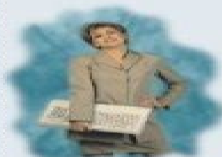
Elite-II is an elite computer! After all, you're the elite.