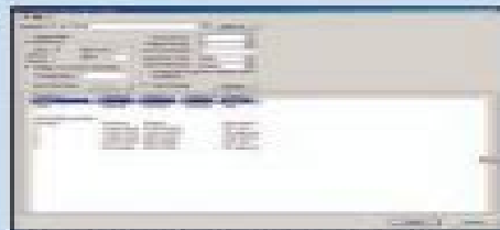
The customizable Import Manager gives flexibility during data transfer