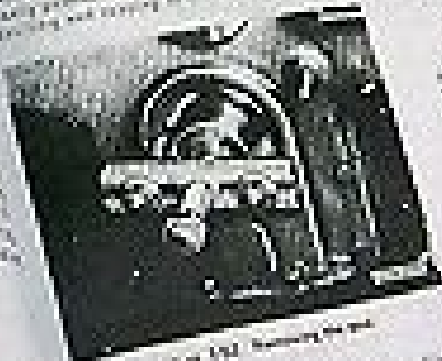
FIG. 1-22. Removing the old water ring oiler.

4. Remove the crankcase from the crankcase.