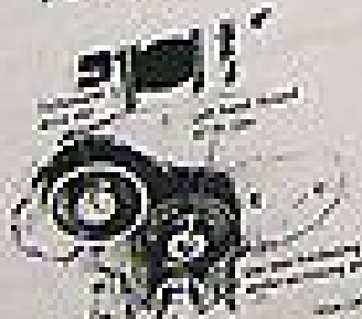
FIG. 1-21. Removing the old water ring oiler.