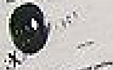
FIG. 1-20. Removing the old water ring oiler.