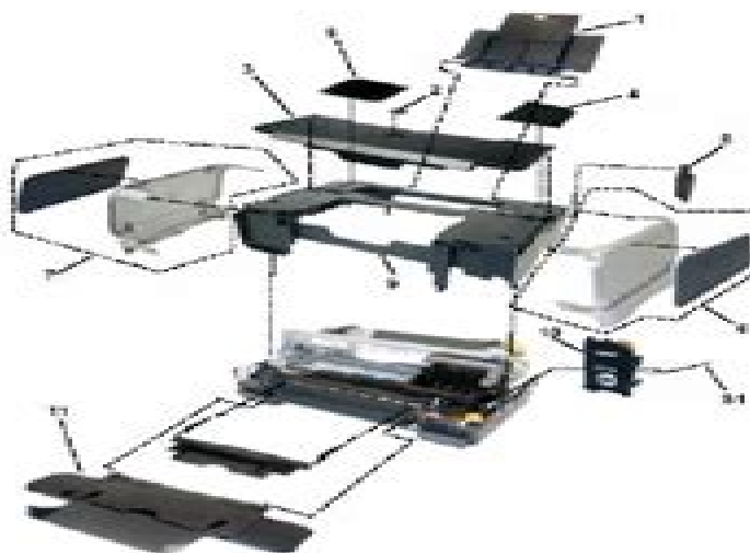
OPERATION PANEL UNIT & UPPER COVER UNIT