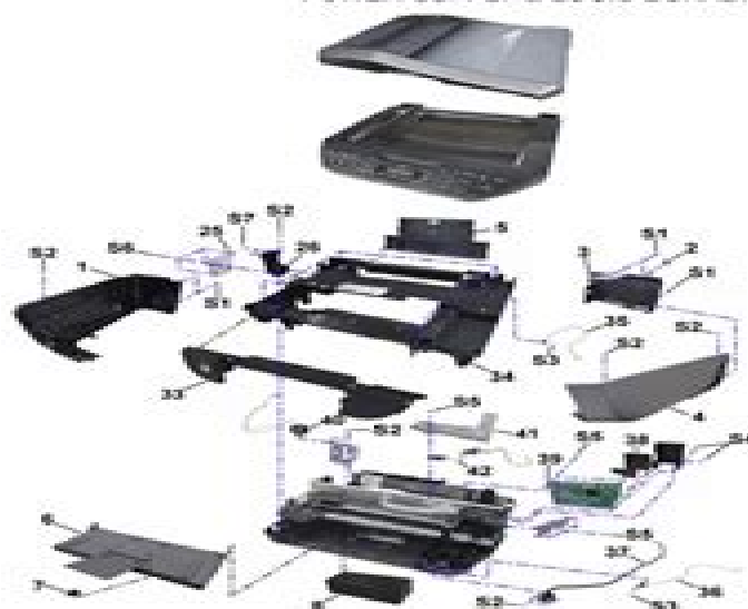
EXTERNAL PARTS POWER SUPPLY & LOGIC BOARD.