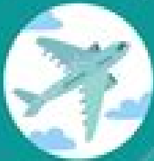
CROSSING TIME ZONES