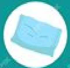
UNCOMFORTABLE BED OR PILLOW