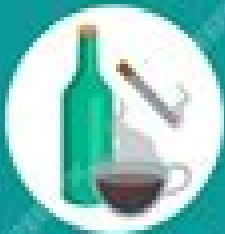
ALCOHOL, SMOKING OR CAFFEINE