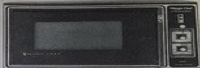
MW300 SERIES MODEL 5P