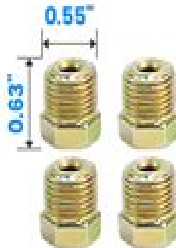
3/16" Inverted Tube Nut