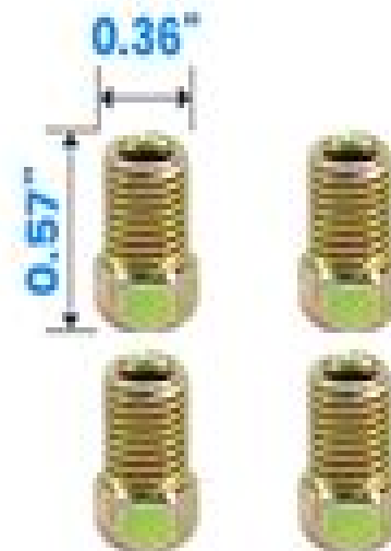
3/16" Inverted Tube Nut