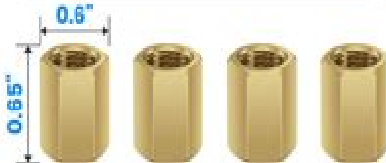
Double Joint Screw