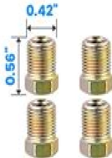
3/16" Inverted Tube Nut