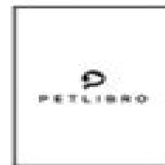
User Guide Kit