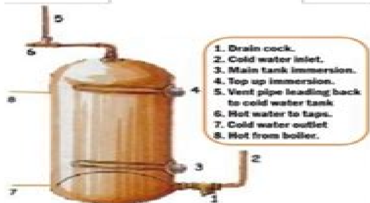
Figure 9 - Direct water cylinder.