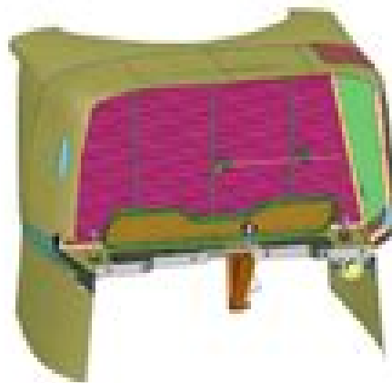
Bell 407, 206L-1/3/4