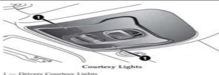
1 — Drivers Courtesy Lights

The courtesy light switch is used to turn the courtesy lights On/Off.