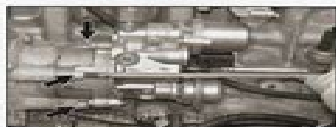
Servicing the direct injection system on turbo models, including replacing fuel pump. 160 Fuel Tank and Fuel Pump