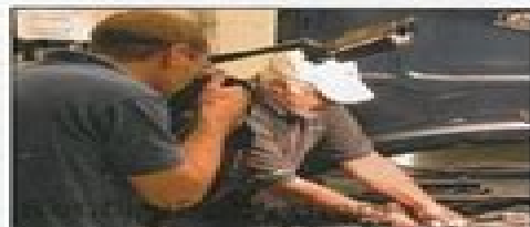
Bentley technical editors removing Valvetronic motor on N51 engine.

The do-it-yourself BMW owner will find this manual indispensable as a source of detailed maintenance and repair information. Even if you have no intention of working on your vehicle, you will find that reading and owning this manual makes it possible to discuss repairs more intelligently with a professional technician.