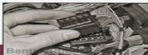
Extensive electrical component location information. ECL Electrical Component Locations