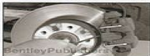
Detailed brake pad and rotor service. 340 Brakes