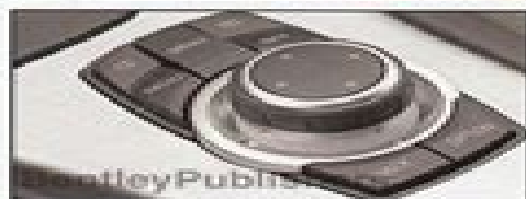
Learn how to reset condition-based service (CBS) intervals using iDrive or stalk switch (cars without iDrive). 020 Maintenance