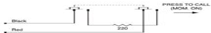
Figure 2 - CA15C Schematic Diagram