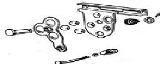
Clutch operating mechanism