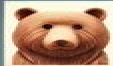
BROWN CHOCOLATE BOYFRIEND