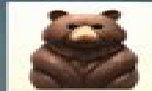
BROWN CHOCOLATE BOYFRIEND