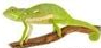
Flap Necked Chameleon