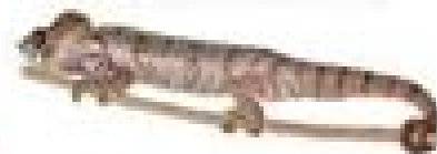
Malagasy Giant Chameleon