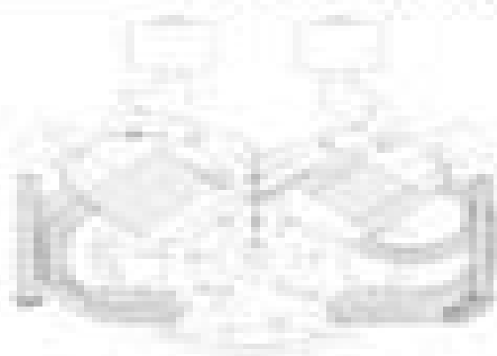
FIGURE 1 (Part Drawing)

THIS MANUAL CONTAINS IMPORTANT SAFETY INFORMATION. READ IT CAREFULLY AND HAVE IT AVAILABLE TO THOSE PERSONNEL OPERATING THIS UNIT. READ, UNDERSTAND AND FOLLOW ALL INSTRUCTIONS BEFORE OPERATING THIS EQUIPMENT TO PREVENT INJURY OR EQUIPMENT DAMAGE.