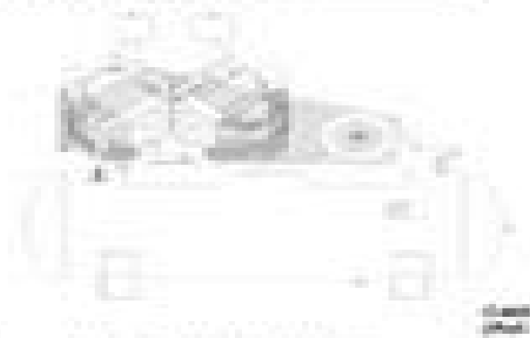
FIGURE 2 (Part Drawing)