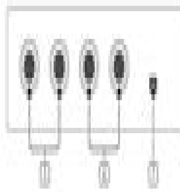
Fig. 3.2 Rear panel (A)