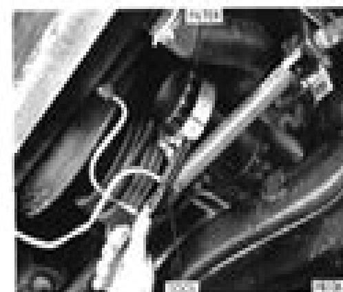
Fig. 23 Engine Oil Filter (360, 426, 440 Cu. In. Engines)