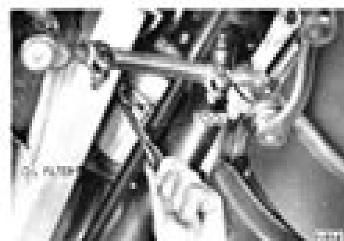
Fig. 22 Engine Oil Filter (318 and 340 Cu. In. Engines) Dart Models