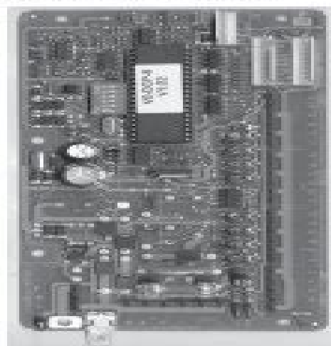
+12V DC Supply Connection