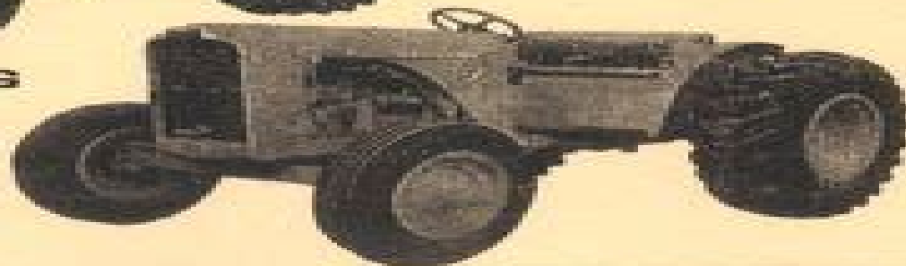
CHAMPION INDUSTRIAL MK.II