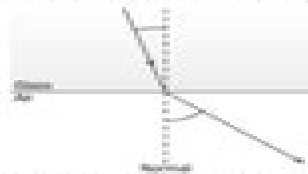
When light moves from glass into air, the light speeds up. The light ray bends away from the normal.