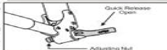
Fig. 4 Rear wheel Quick Release with lever in open position.

4. REAR WHEEL: Place the rear wheel quick release lever in the open position, as shown in Fig. 4. Insert the rear wheel's stub axle into the hole in the