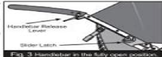
Fig. 3 Handlebar in the fully open position.

3. HANDLE: Rotate the stroller handle up to the fully open position. Slider Latches will lock into place (Fig. 3).