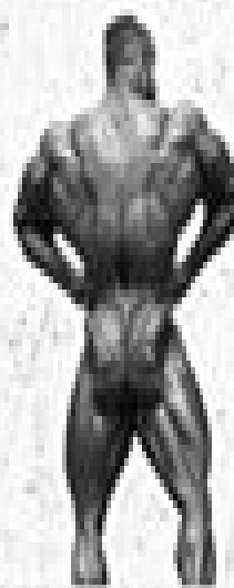
REAR LAT SPREAD