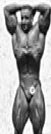
ABDOMINAL AND THIGH