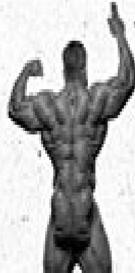
REAR DOUBLE BICEPS