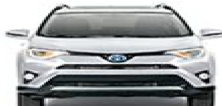
TOYOTA RAV4 HYBRID