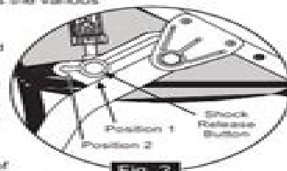
Fig. 2 Swingarm in unfolded position with shock in position 1.

Re-insert the axle fully into the rear dropout until the axle shoulder or snap ring on the axle comes in contact with the dropout (Fig. 5). Move the quick release lever to the closed position (Fig. 6). The word CLOSE should be clearly visible and the quick release lever should almost touch dropout.