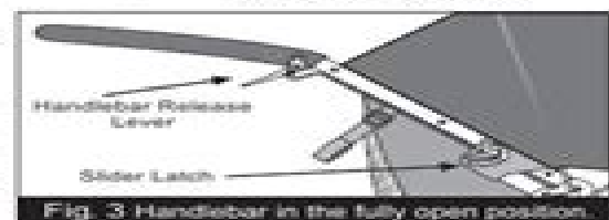
Fig. 3 Handlebar in the fully open position.