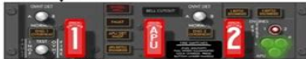
Engine and APU Fire Control Panel (P8)