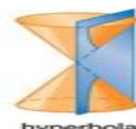
Figure 2 Types of Conic Sections

A focus is a point about which the conic section is constructed. It is a point about which rays from the curve converge.