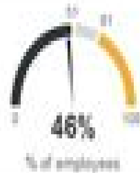
Employees that are Treated Impartially