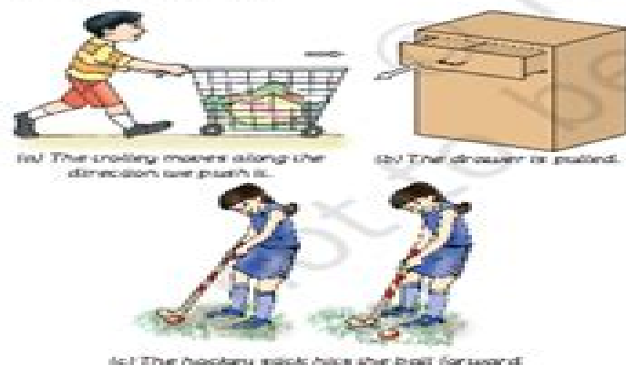
Fig. 9.1: Pushing, pulling, or hitting objects change their state of motion.

For many centuries, the problem of motion and its causes had puzzled scientists and philosophers. A ball on the ground, when given a small hit, does not move forever. Such observations suggest that rest is the “natural state” of an object. This remained the belief until Galileo Galilei and Isaac Newton developed an entirely different approach to understand motion.