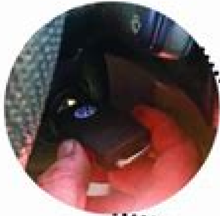
Problems with the ignition system