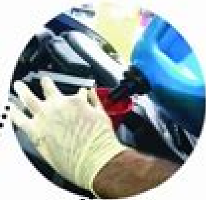
Low on oil