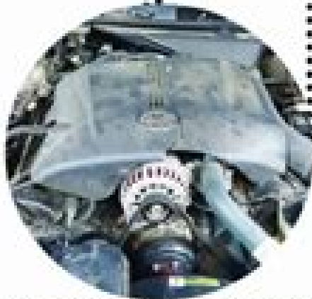
Issues with sensors found throughout the engine