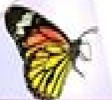
Image after enlargement