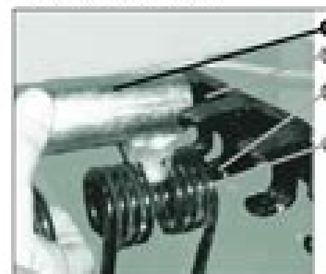
Fig. 34 Hooking in the line arm