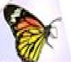
Image after enlargement