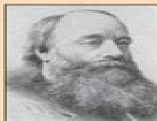
James Prescott Joule (1818 – 1889)

James Prescott Joule was an outstanding British physicist. He is best known for his research in electricity and thermodynamics. Amongst other things, he formulated a law for the heating effect of electric current. He also