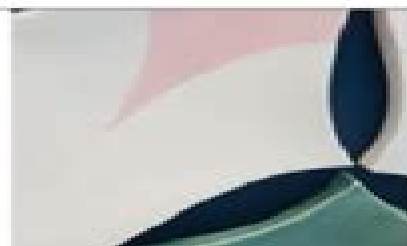
2 Liz White, Pink, and Green Glaze