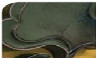
1 Green Breaks Blue glaze