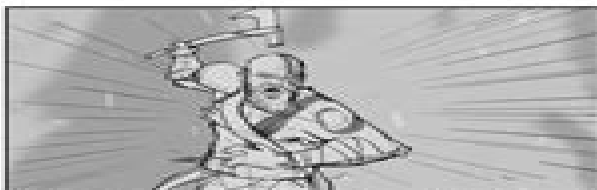
7. We cut to a close up of KRATOS readying to strike.