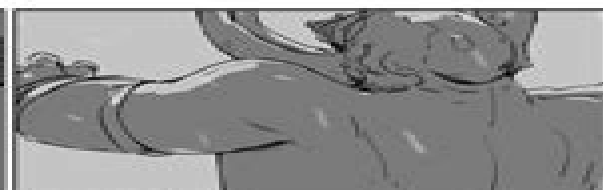
11. The NORSE TROLL staggers in front of the camera.