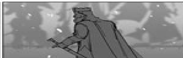
2. We FLASH FORWARD. The KING is standing in a snowy forest.