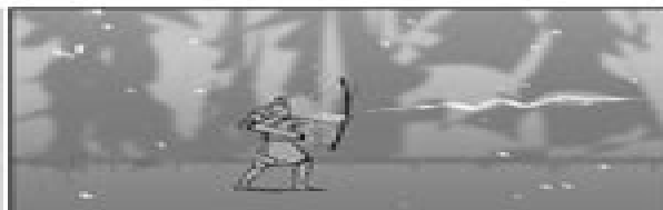
5. The SON shoots an electric arrow.