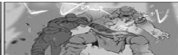
6. We cut to KRATOS running towards a NORSE TROLL as the SON's arrows rain overhead hitting the NORSE TROLL.