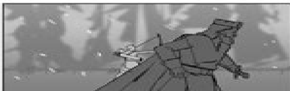
4. The KING runs after KRATOS revealing the SON.