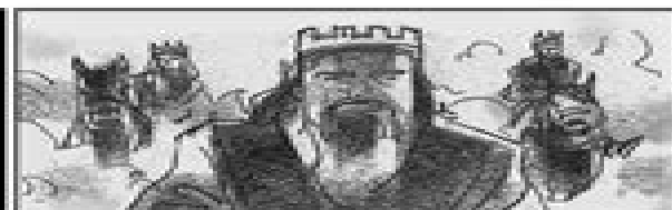
14. We return to KING is charging through a field.