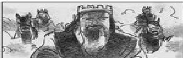
1. The KING is charging through a field.