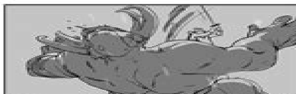
10. We cut to the KING striking the NORSE TROLL popping him up.