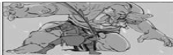
8. KRATOS slashes the NORSE TROLL bringing him to his knees.