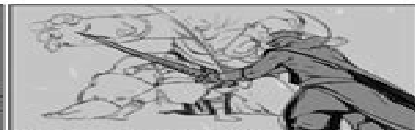
9. We reframe the shot to reveal the KING readying a strike.