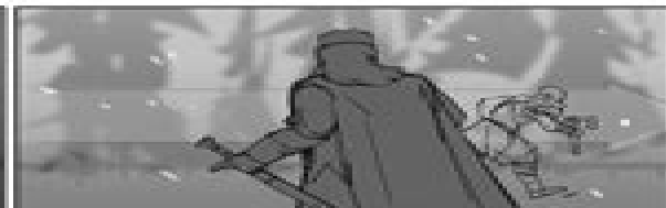
3. KRATOS runs past the KING.