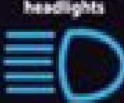
Main beam headlights