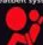
Airbag and seatbelt system