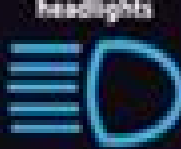
Main beam headlights