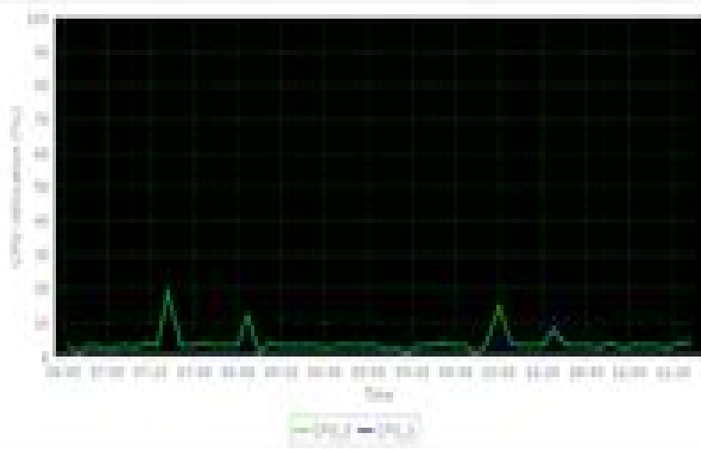
Break up of CPU Utilization - by CPU Core