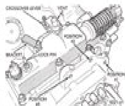
Fig. 2 Left Engine Mount Bolt Location

When removing or installing the transaxle, it may be helpful to use locating pins to place of the top transaxle to engine bolts (Fig. 3).