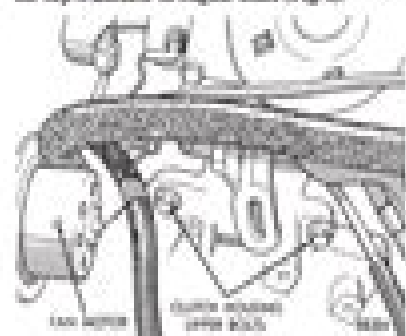
Fig. 3 Remove or Install Bolts

When removing or installing the transaxle, it may be helpful to use locating pins to place of the top transaxle to engine bolts (Fig. 3).