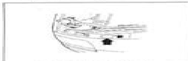
Fig. 1 VIN plate location