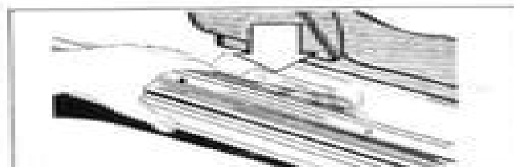
Fig. 4 Chassis number location