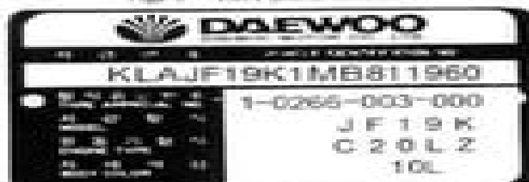
Fig. 2 Vehicle identification number(VIN) plate