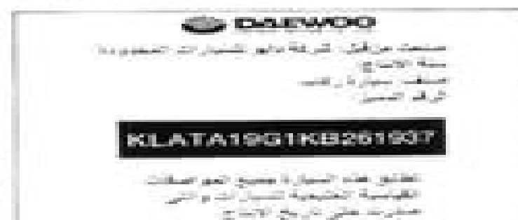
Fig. 5 GUC conformity label