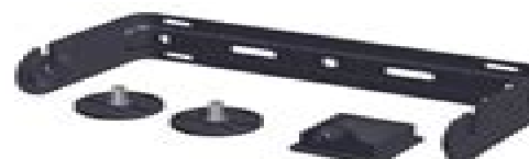
Models CMX-SM, CMX-LG EXUB-S6, EXUB-S8 EXUB-S10