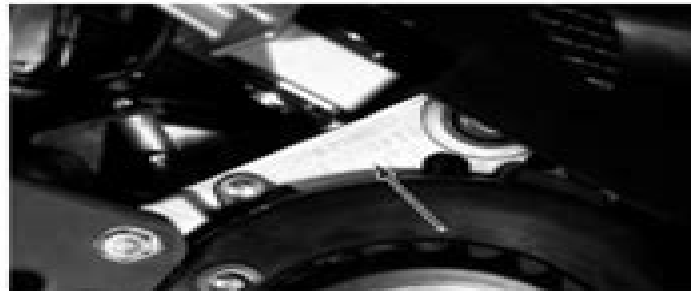
ENGINE SERIAL NUMBER LOCATION